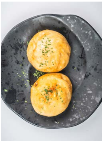
CRUNCHY PORK "BAO"