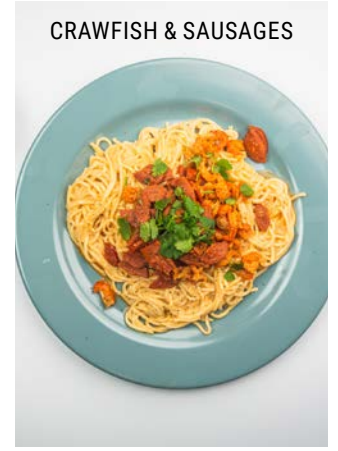
CRAWFISH & SAUSAGES