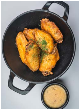
"SOUP SHOP" WINGS