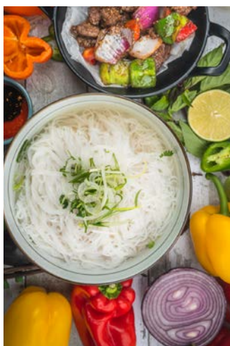
PHO FILET MIGNON