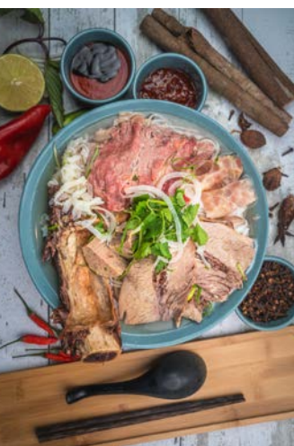
PHO COMBINATION + RIB-BONE