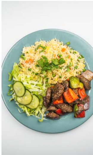
SHAKEN FILET MIGNON CUBES