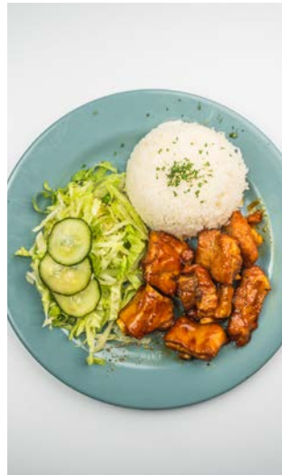
BABY BACK RIBS PORK