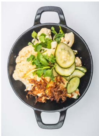
CRUSTED PARMESAN CAULIFLOWER