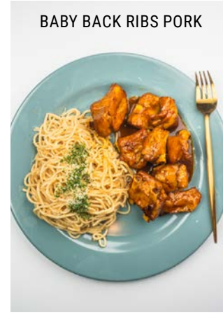
BABY BACK RIBS PORK