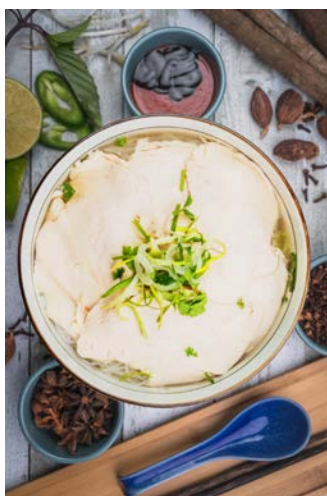
PHO CHICKEN BREAST