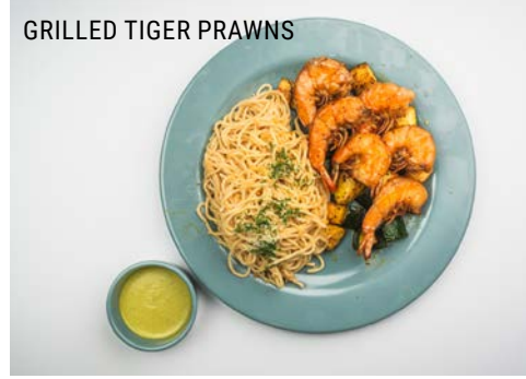
GRILLED TIGER PRAWNS