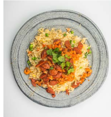
CRAWFISH FRIED RICE