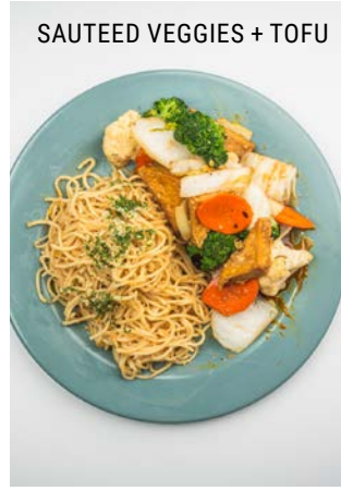
SAUTEED VEGGIES + TOFU